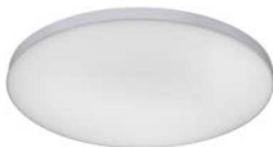
1 SMART+ WIFI PLANON 450