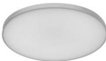
2 SMART+ WIFI PLANON 300