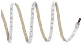
Prewired cables on both sides

IP65 protected RGB LED strips with 500 lm/m for general applications