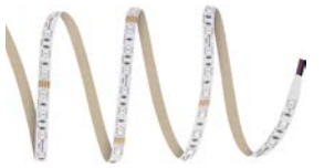
Prewired cables on both sides

RGB LED strips with 500 lm/m for general applications