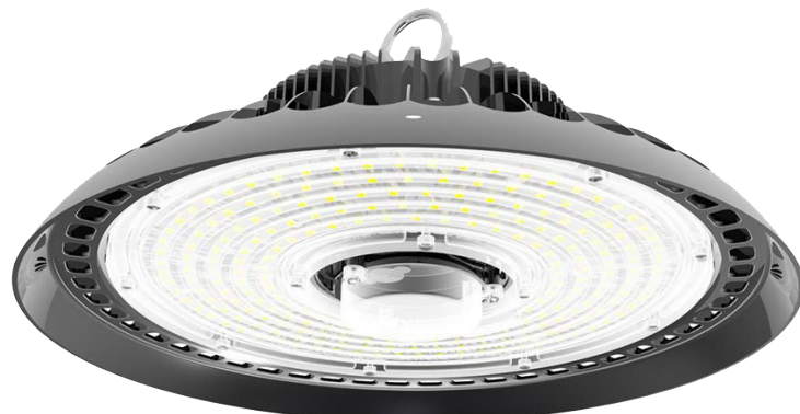
UFO HIGH BAY WITH RESENTS SENSOR